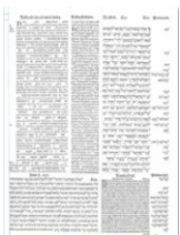
Complutensian polyglot Bible (Rome, Library of the Society of Jesus?). 1517-1520.