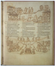
Utrecht Psalter (Utrecht, Universiteitsbibliotheek. MS, Bibl. Rhenotraiectinae I Nr 32), 816-835.