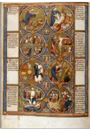
Vienna Moralized Bible (Vienna, ÖNB. Cod. 2554), Genesis scenes, c. 1225.