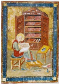
Codex Amiatinus (Florence, Biblioteca Medici-Laurenziana. Cod. Amiatino 1), Frontispiece, 8 th century.