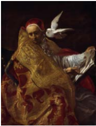
Roman School. Pope Gregory the Great. Oil on canvas, c. 1620? BF.1984.21