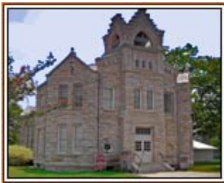
Old Fayette County Jail

La Grange is rich in culture and history with Monument Hill State Park, The Faison Home, the Railroad Depot Museum, the Old Fayette County Jail and the infamous "Chicken Ranch;" as well as sitting on the Texas Independence Trail, exploring the story of how Texas won its freedom from Mexico.